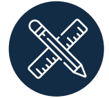
Operation & Optimisation