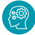
Planning & Design