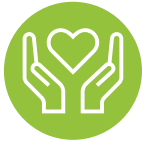
Health - Check